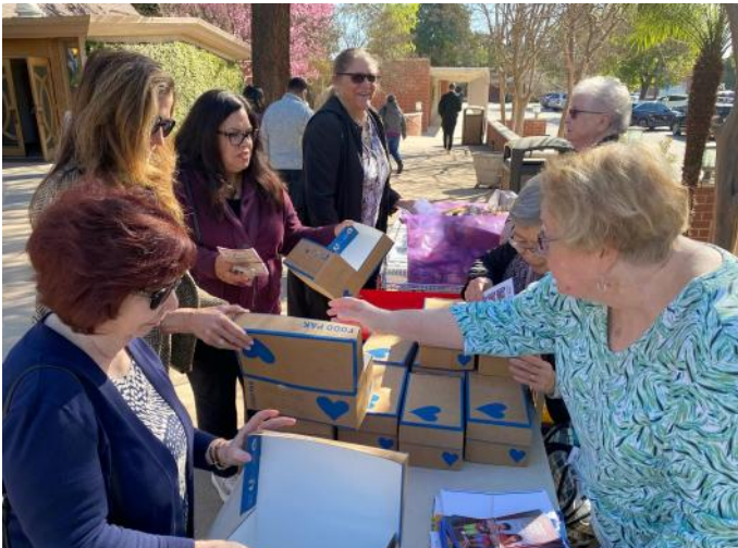
CHF Food Paks